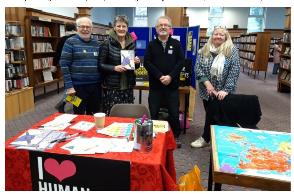
Glasgow Daytime AI Group's Write for Rights event at Langside Library