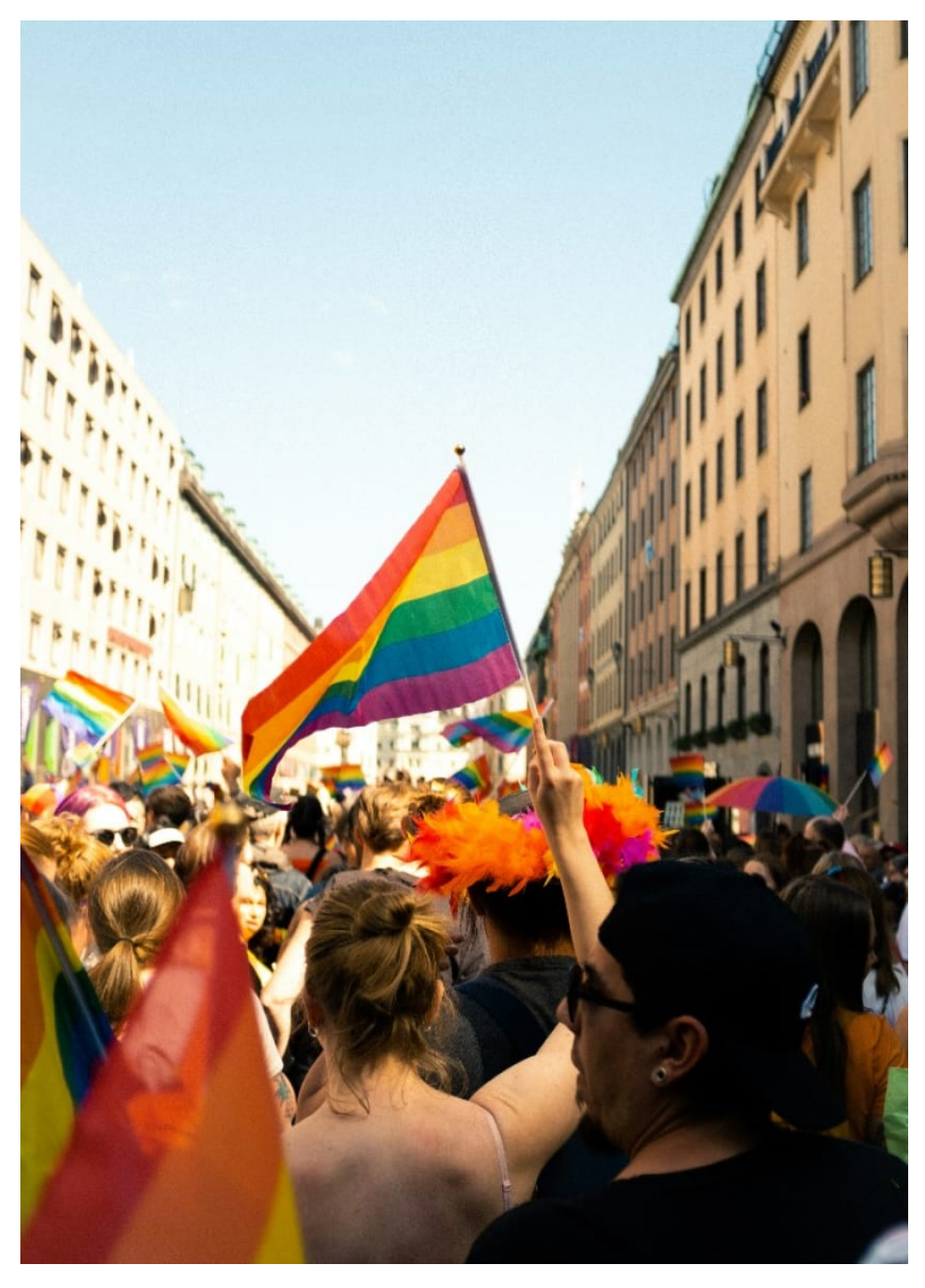
Last year's Glasgow Pride march attracted 50,000 participants. This year, organisers are hoping

For theoring Event - Pride March & Rally Glasgow – 20 \mathrm{th} July 2024